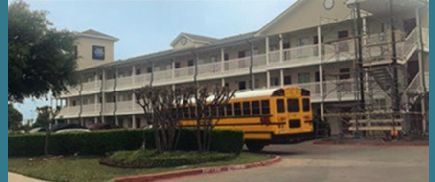
Hidden in plain sight